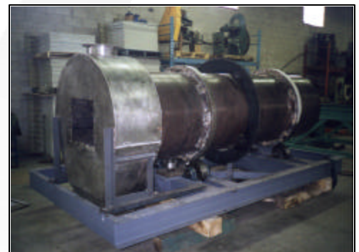
3' Diameter x 10' Long Agglomerator