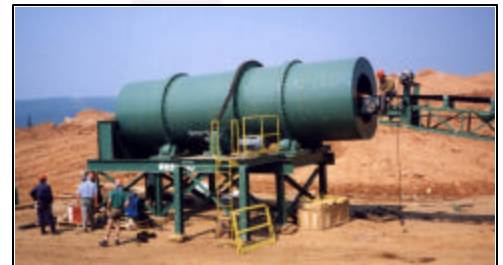
Modular Frame for Quick Installation