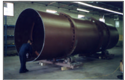
Heavy Duty Drum & Riding Ring Construction