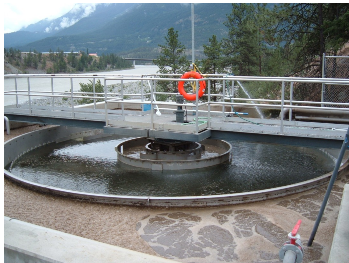
Top: Westpro 90ft diameter Clarifier in Canada Middle: Westpro 26ft diameter Clarifier in Canada Bottom: Typical Fines Removal System elevation view