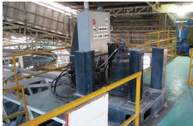
Westpro 48ft high capacity thickener retrofit hydraulic drive and control panel