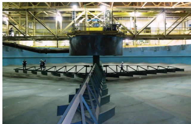
View of Westpro's 138ft diameter high capacity thickener mechanism

Experienced site service personnel are available for projects all over the world, providing services ranging from an initial site inspection and process audit through to the commissioning of the upgraded thickener. Ongoing support is provided for spare parts and process optimization.